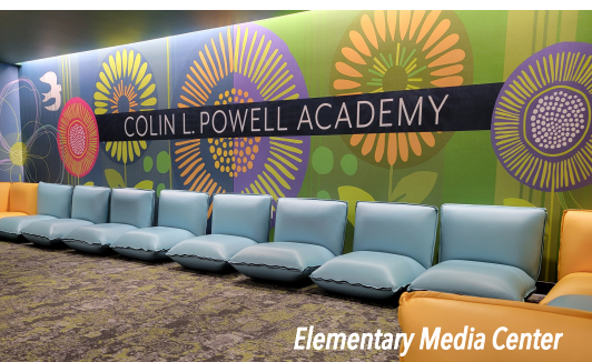
Elementary Media Center