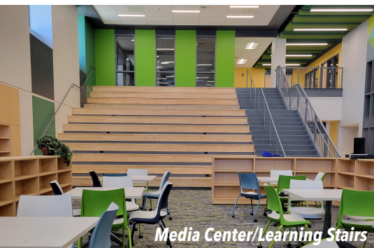
Media Center/Learning Stairs

Of the total funding for the 6-school Blueprint Schools Phase 1 Project, $134 million, or 33%, went to Minority Business Enterprises (MBEs), exceeding the MBE requirement