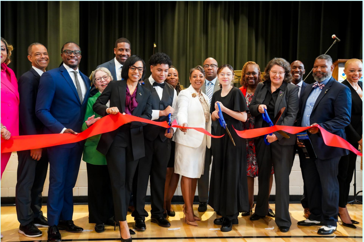
Officials cut the ribbon at the new Hyattsville Middle School.