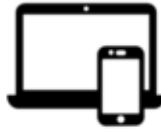
Device Setup (Device Configuration)